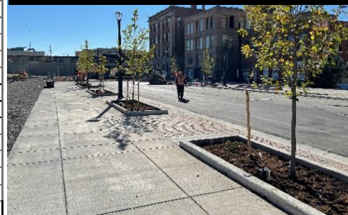
Bettie Cram Drive Looking East