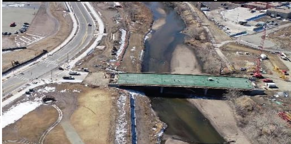
51st Ave River Bridge and National Western Drive Looking South

Gray shading = Complete A = Actual Date * Continuing to assess potential COVID-19, market impacts, design options, costing, recovery opportunities on program/schedule