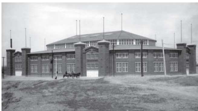
The brick-and-steel 1909 Stadium Building at 4655 Humboldt St. was the primary entertainment venue for the National Western Stock Show from 1908 to 1951, and will be used by the Stock Show through 2025.

As the City and County of Denver transitions from rescue to recovery, investment in community, business and infrastructure will be critical to its success. Funding the market will create jobs and help small businesses thrive, and enhance the health and well-being of our communities.