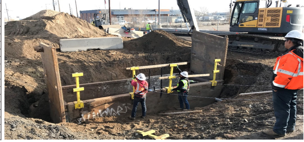
Setting up handrail on a trench box for sanitary sewer - north of 48th Ave. near the Post Office