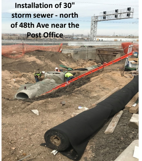
Installation of 30" storm sewer - north of 48th Ave near the Post Office