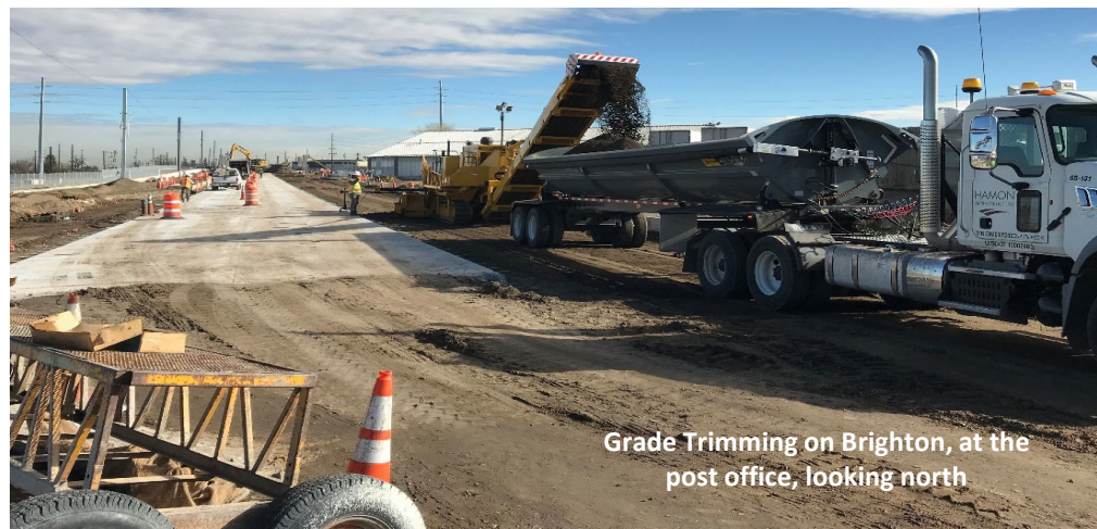
Grade Trimming on Brighton, at the post office, looking north