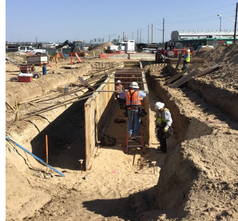
Formwork for Stormwater Planter west side of Brighton, south of 48th and Brighton intersection