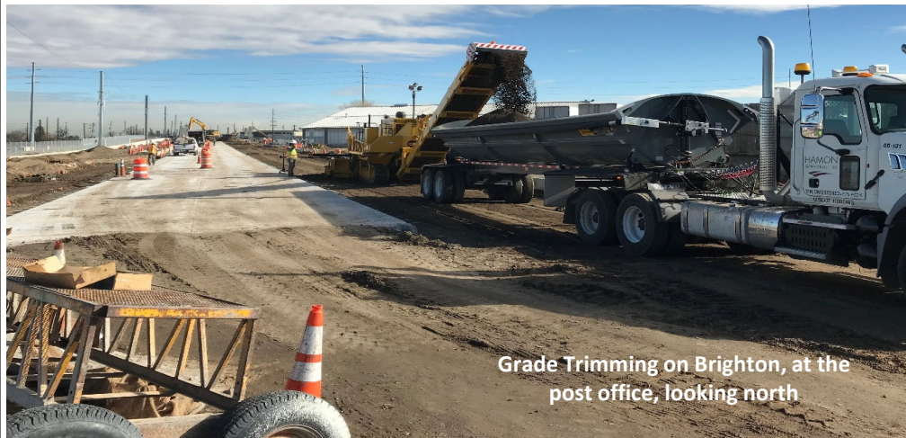
Grade Trimming on Brighton, at the post office, looking north